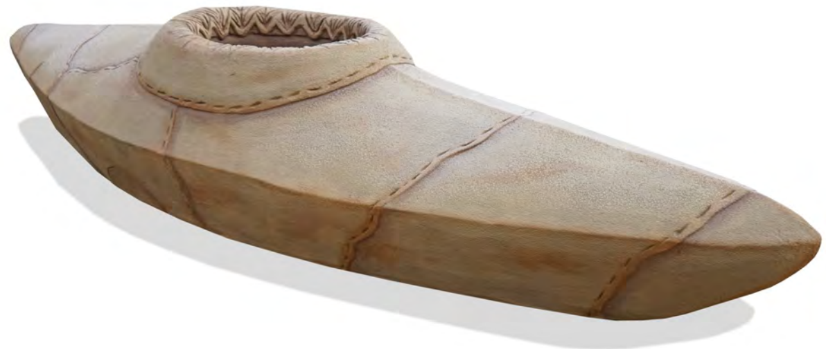
3 Arctic Kayak_SC047